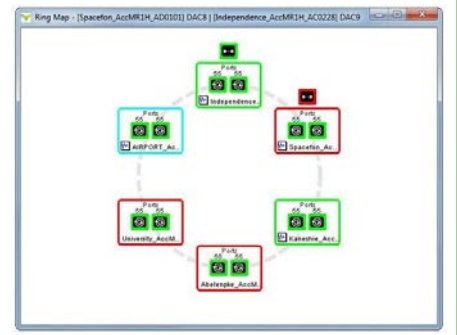
An Eclipse network ring displayed in ProVision—problem links are highlighted in red for user-friendly management.

ProVision is Aviat Networks' comprehensive and feature-rich network management system. It is used by MTN Ghana to manage the national network, both Aviat and thirdparty devices. ProVision's displays and reports provide a complete overview of network health and performance. To view the Accra region in ProVision, Services used ProVision's fast deployment functions, including auto-deployment, which locates and identifies Eclipse and other network devices automatically, and network health reports.