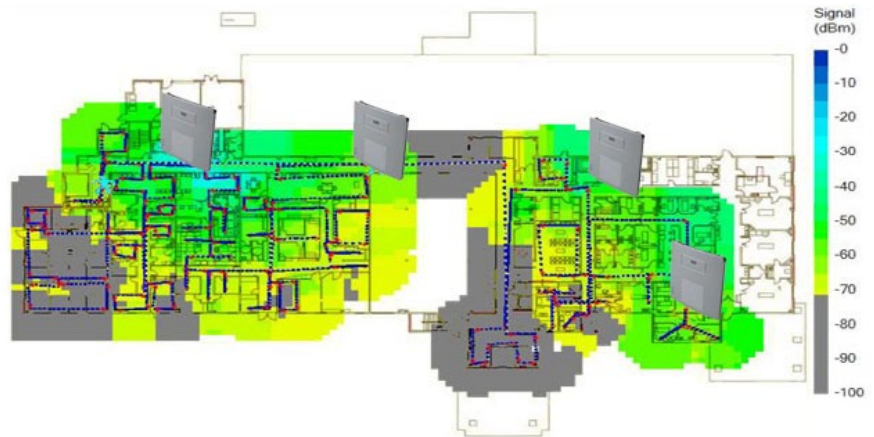
AFTER: Two Ruckus 7363 APs with dynamic beamforming